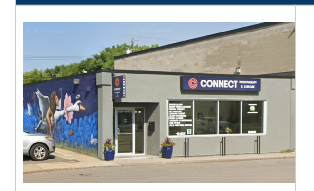
Connect Physiotherapy and Exercise (Allendale)