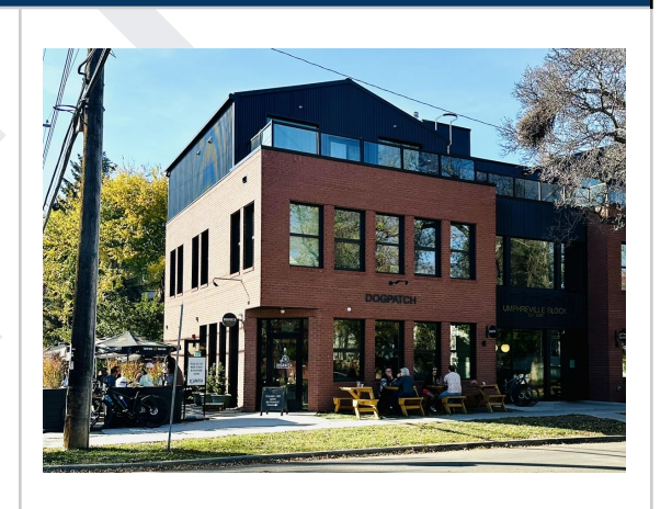
Dogpatch Bistro Pub (Riverdale)