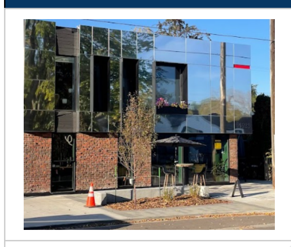
Boxcar Coffee Shop (Calder)