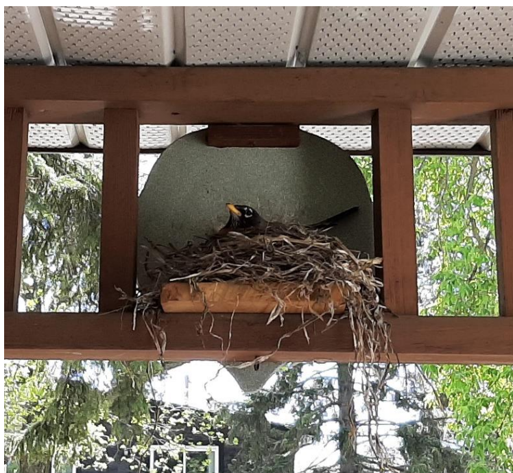
FINE-FEATHERED FRONT PORCH FRIEND ... AND FAMILY TO BE