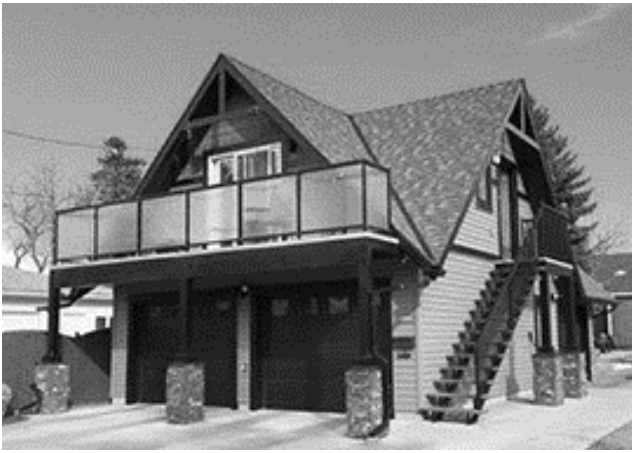
Custom Garage & Garden Suite Designs & Construction by: