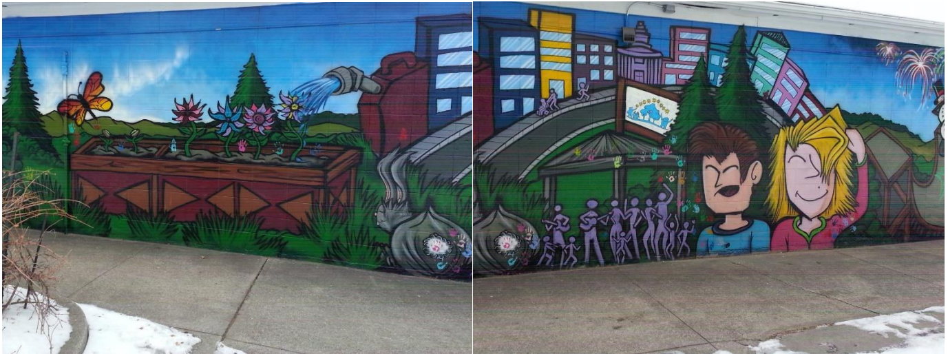
THE WALL MURAL SAYS IT ALL....